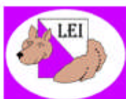
Leicestershire Orienteering Club (LEI)

http://www.leioc.org.uk/news/markfield-streetview-o-june-2010-easy.php