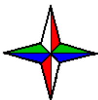
Derwent Valley Orienteers (DVO)

http://www.leioc.org.uk/news/markfield-streetview-o-june-2010-easy.php