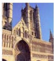
Lincoln Orienteering Group (LOG)

LOG's midsummer madness chasing sprint seemed to reek carnage with the competitors as many got confused by the fast paced challenges and the university campus resulting in 9 disqualifications.