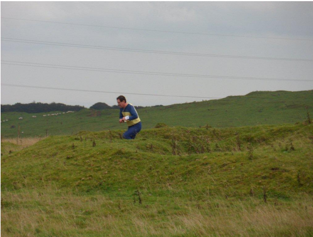
The Editor exits a pit at Carsington

Are there other sorts of orienteering we should be recognising in the East Midlands? With all of the community orienteering clubs, should we be looking to encourage cross community club competition? If so, what form should this take? Or should community orienteering look only to compete within their parent clubs?