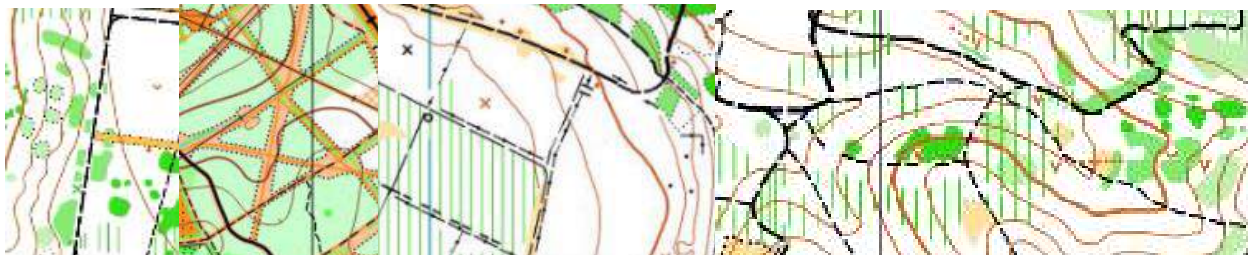
Cademan Woods; Bagworth;